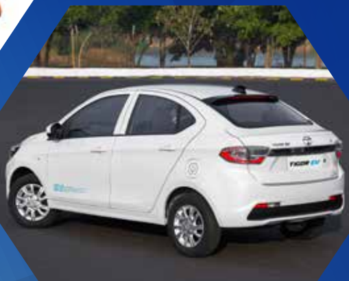
Breakfree coupe- inspired roof line