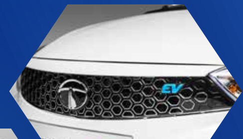
Diamond front grille with chrome humanity line