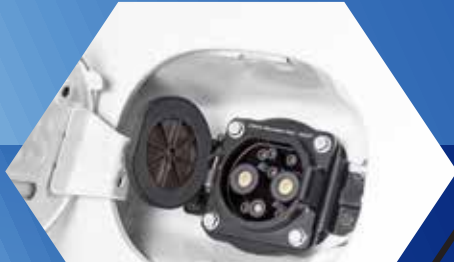
Fast charging socket - 0 to 80% charge in 90 min.*