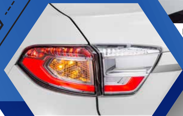
Crystal-inspired LED tail lamps