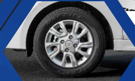
Stylish alloy wheels (Available in XT only)