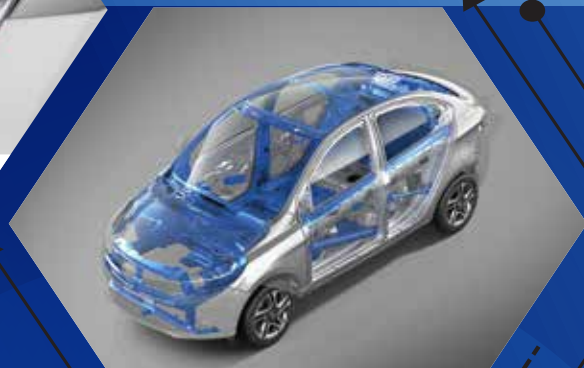
Reliable architecture with cocoon like safety cell