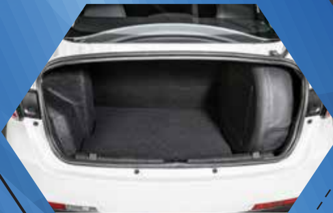
Spacious boot with 310 L capacity