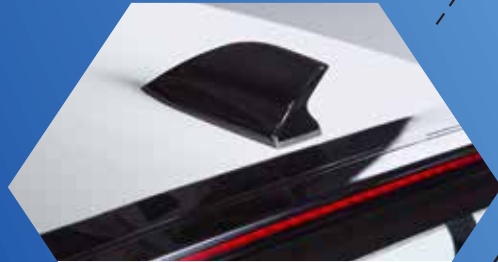
Piano Black shark fin antenna and LED high mounted stop lamp