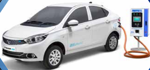
Fast charge your zero-emission Tigor electric##